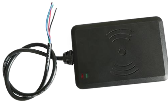
Figure 1. Appearance of DR102