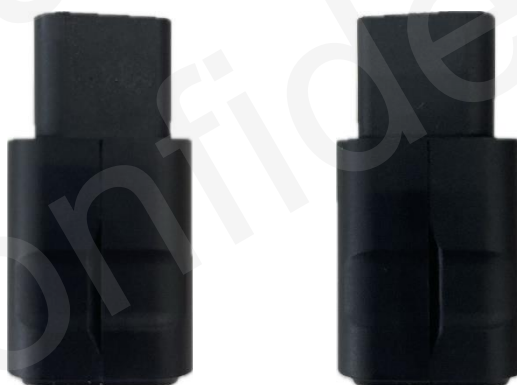
Figure 6: Close the Case

Put the upper cover on the lower cover, and press the covers to make sure they are closed completely.