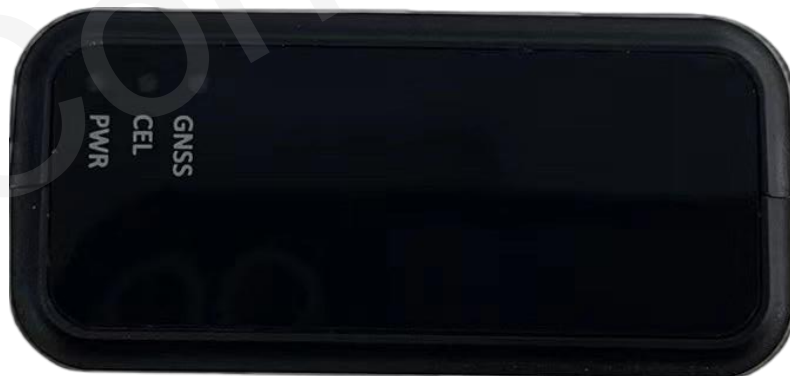
Figure 3: LED Lights of GV500CG

GV500CG has three status LED lights, which are GNSS LED, CEL LED and PWR LED.